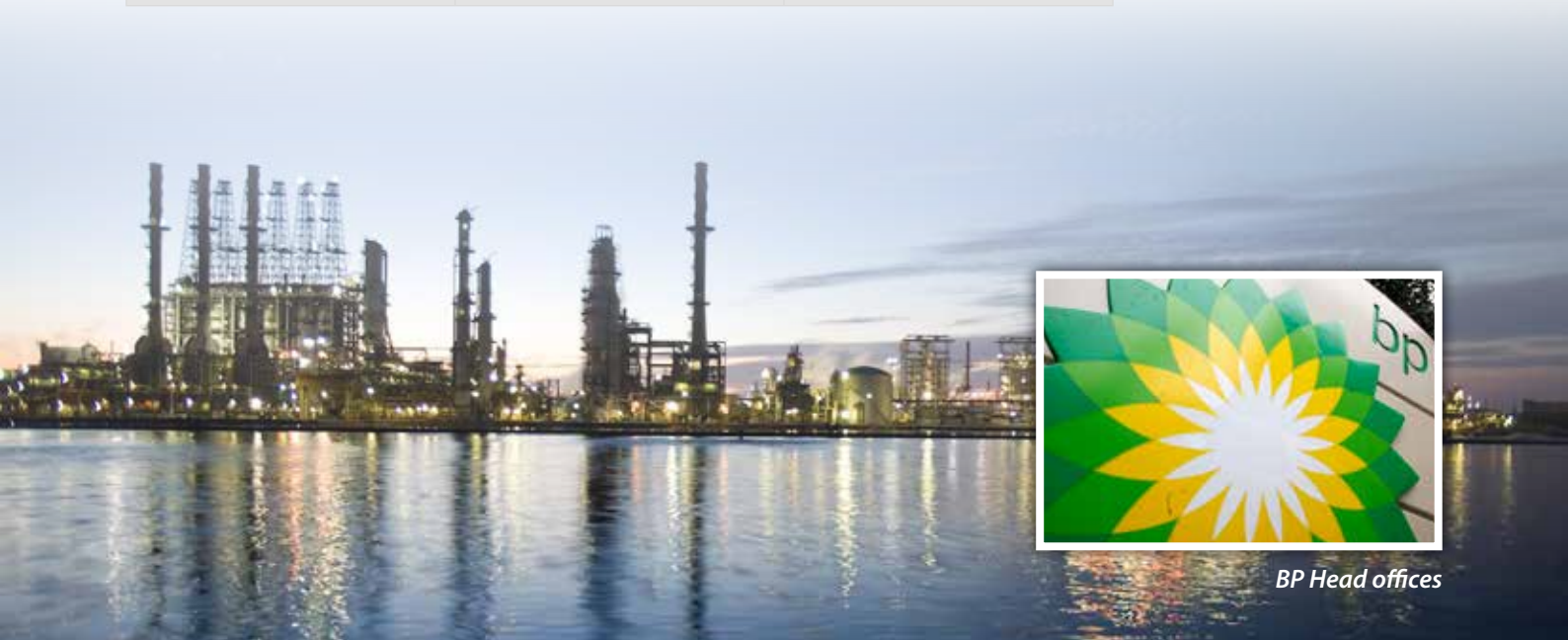
BP Head offices